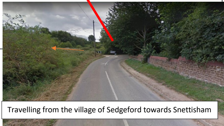
Travelling from the village of Sedgeford towards Snettisham